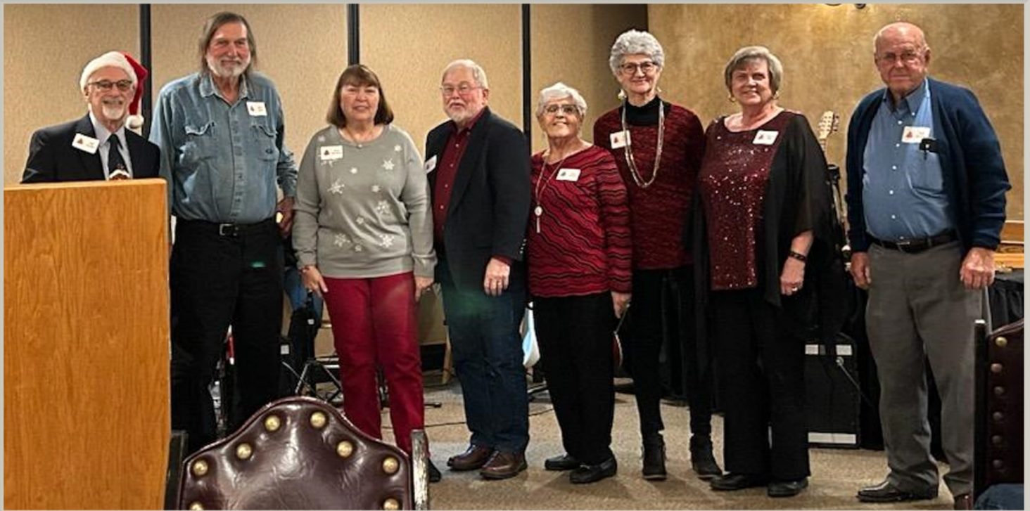
2024 GOVERNING BOARD

MAFCA 2024 National Convention June 23 - June 29