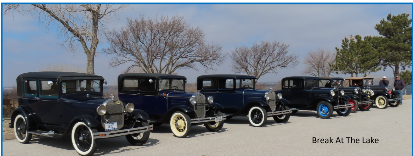
Break At The Lake

Members enjoyed a beautiful day for our Spring Tour. After gathering at Belmont, we headed north, maneuvering safety through the 14 & Adams St roundabout. We then traveled through Raymond on our way to Branched Oak Lake. Upon arriving at the Lake we took a short break from touring. It was then on to our drive around the lake. While crossing over the dam, quite a few pelicans were seen on the water and in the sky. When our tour around the lake was complete, we headed back to Lincoln, going through Malcom and passing by Pawnee Lake. Our tour ended with a stop at Shoemakers for lunch. Touring were Dick & Jerry Waechter, Robert & Judy Callaway, Gary Horn, Bill & Linda Buckley, Loren & Valda Davidson, Dean & Margaret Mays, and Harv, Judy, Lance & Avery Jecha.