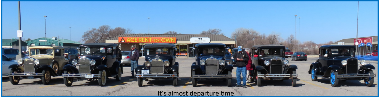
It's almost departure time.