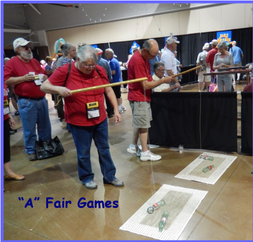
"A" Fair Games