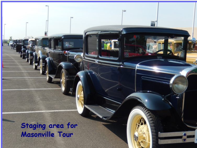
Staging area for Masonville Tour