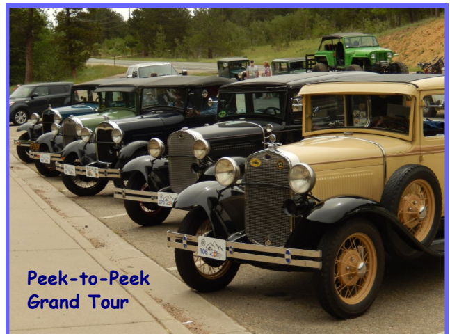
Peek-to-Peek Grand Tour