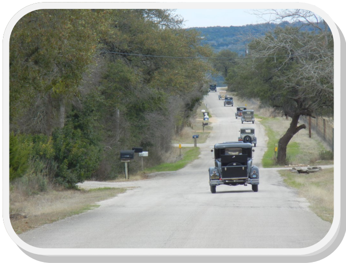
Driving through the Texas Hills