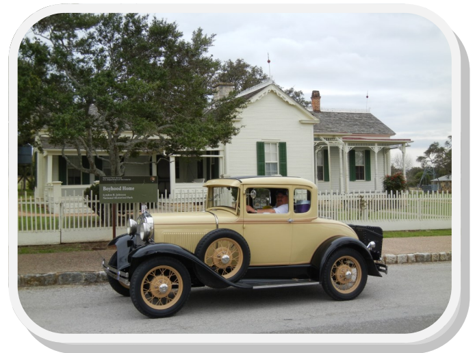
LBS's Boyhood Home