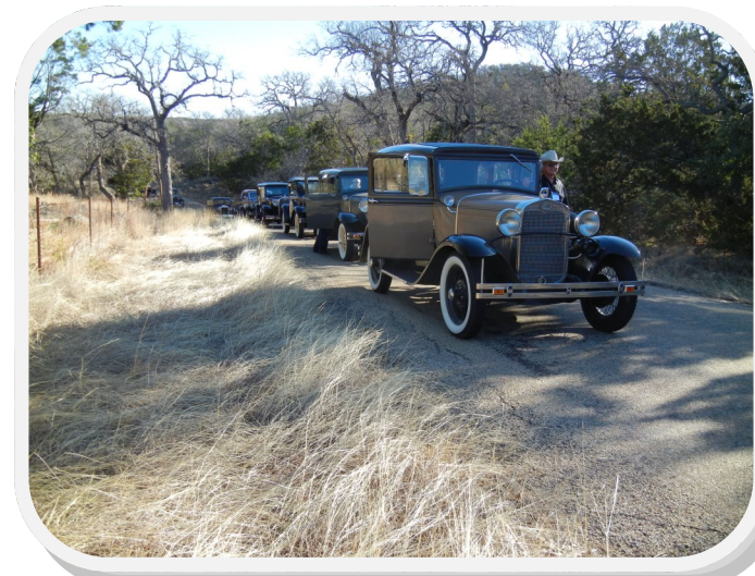
Photo op time