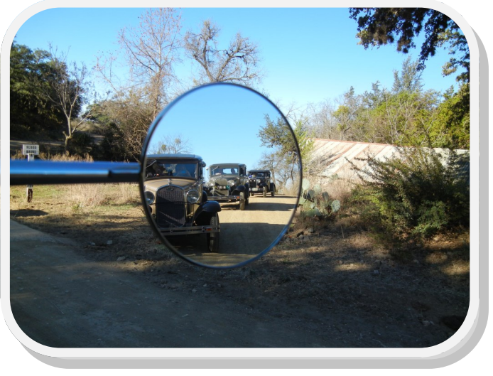
How many cars are behind us????