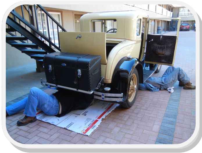
Repairs in the parking lot.